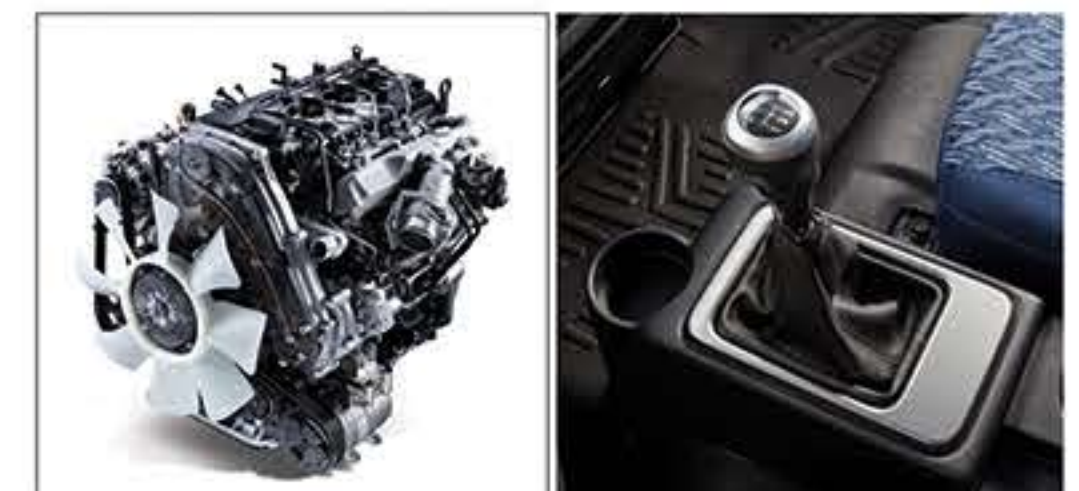
2.9-liter Direct Injection Diesel Engine with Turbocharger Intercooler System