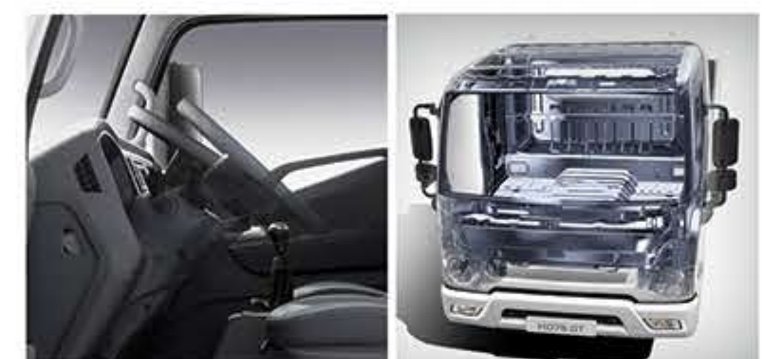
Adjustable Steering Wheel