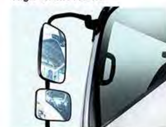
Big, clear side mirrors to give you ample visibility of driving surroundings