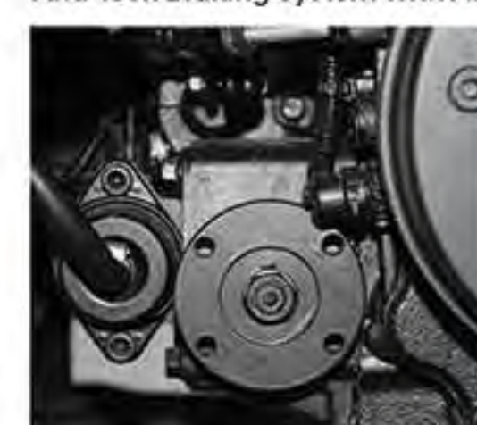
Power Take-Off (PTO) This device transfers power from the driveline to a secondary application, which may drive a hydraulic pump, generator, air compressor, pneumatic blower, or vacuum pump.