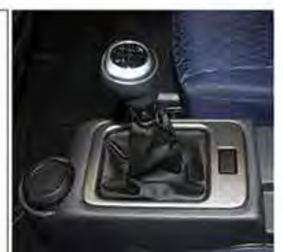
5-speed Manual Transmission System