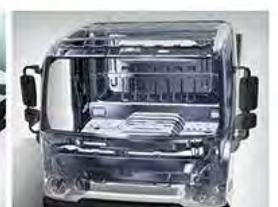
High-tensile Steel Cab