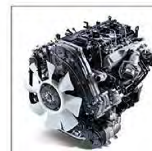
2.9-liter Direct Injection Diesel Engine with Turbocharger Intercooler