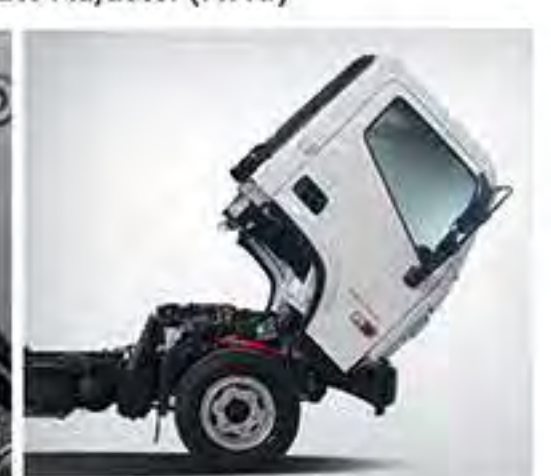
Wider Cab Tilting Angle - 46° tilt angle