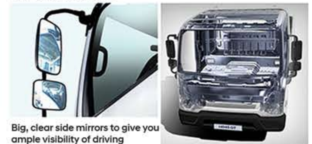
Big, clear side mirrors to give you ample visibility of driving surroundings