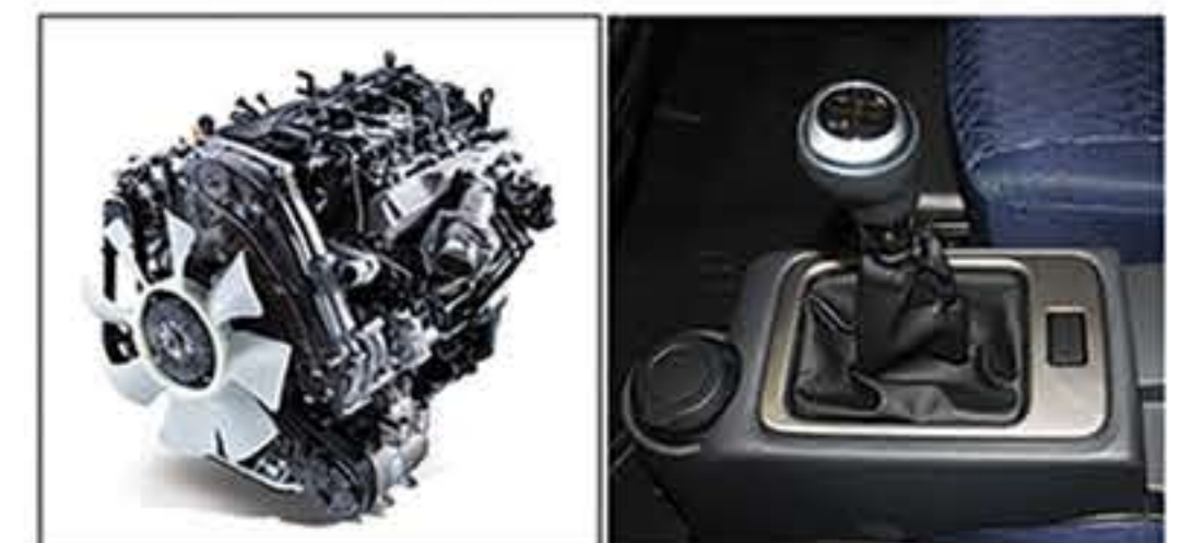
2.9-liter Direct Injection Diesel Engine with Turbocharger Intercooler System 5-speed Manual transmission System