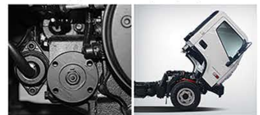
Power Take-Off (PTO) This device transfers power from the driveline to a secondary application, which may drive a hydraulic pump, generator, air compressor, pneumatic blower, or vacuum pump.