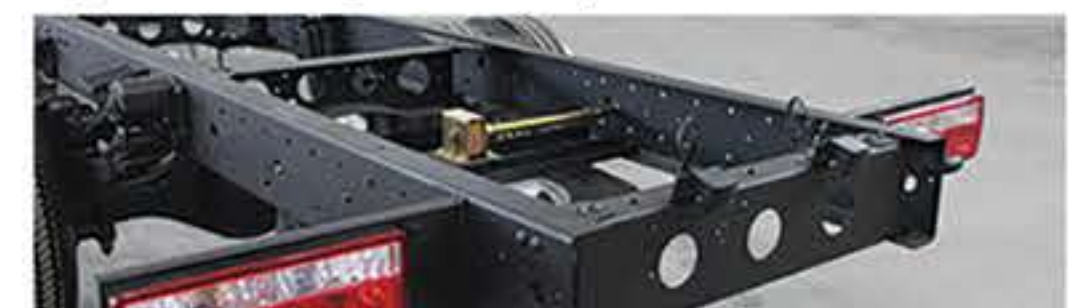
High-tensile Steel Frame